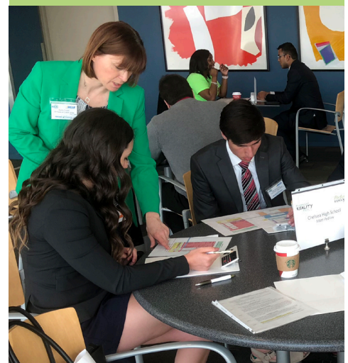
Credit Union Financial Advice